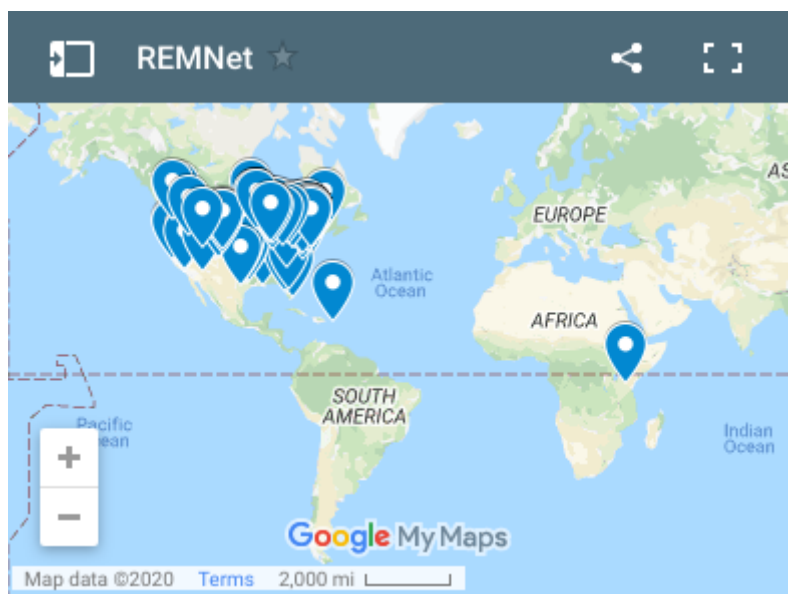
An interactive map of where the REMNet members are. Double click to start.