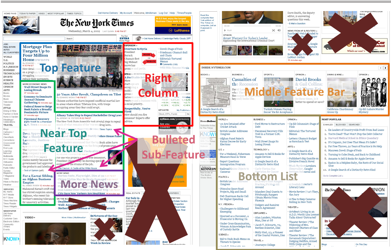
Figure 1 HOME PAGE LOCATION CLASSIFICATIONS

Notes: Portions with "X" through them always featured Associated Press and Reuters news stories, videos, blogs, or advertisements rather than articles by New York Times reporters.