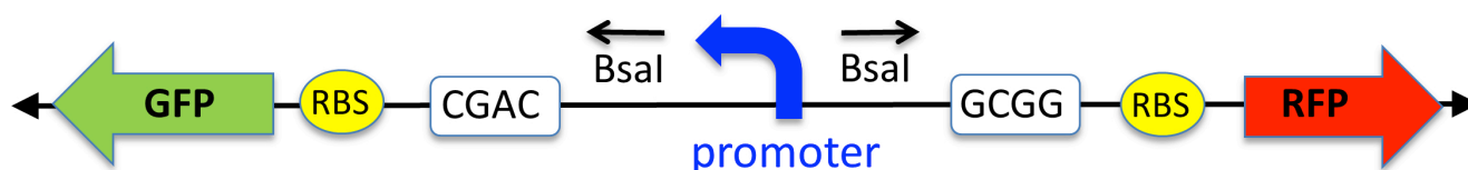
Figure 1. Diagram showing the key parts of the receiving plasmid pClone Red. A GFP gene (promoter, RBS and GFP coding) are oriented from right to left. The promoter is flanked by outwards-facing Bsa I restriction sites. When the promoter is cut out, the sticky ends (white boxes) allow a new promoter to be ligated and initiate transcription to the right of RBS and RFP coding.

Once the promoters are designed, oligonucleotides that will form the 60nt double-stranded DNA promoter sequence are ordered and returned within three business days. When the two oligos are annealed, they produce unique sticky ends that ensure directional cloning which we have verified multiple times. The key to this lesson is the pClone Red plasmid (part number J119137) we designed and built (Figure 1; (24)).