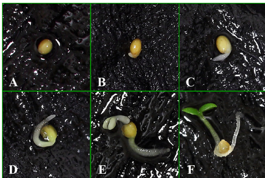
Figure 3. Seed germination. (A) Seed with no signs of germination (B) Seed in the early stages of germination as evidenced by the presence of a radicle that has just broken seed coat. (C, D) Root elongation, (E) Hypocotyl emergence, and (F) Greening of the emerging plantlet.