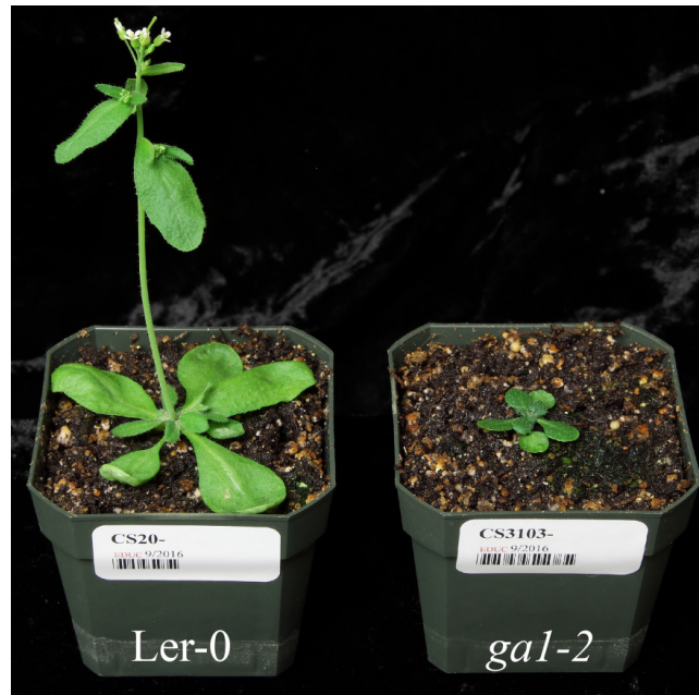
Figure 1. Wild type (Ler-0) and mutant ( ga1-2 ) Arabidopsis thaliana plants shown 27 days after planting. Mutant seeds were soaked in 200 \mu M GA solution for 3 days to initiate germination. No GA was added during subsequent growth. The plant containing the mutation exhibits a severe dwarf phenotype.

described extensively by others (13,14).