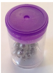
Figure 1. Canister used in experiment.

In the iconic differential equation text [1, pp. 43-48], there is a section on modeling a falling canister of nuclear waste in the ocean to determine the velocity that the canister might have upon striking the bottom of the ocean. This is due to concern that the canister might break open and the lead containment surrounding the nuclear material might fail.