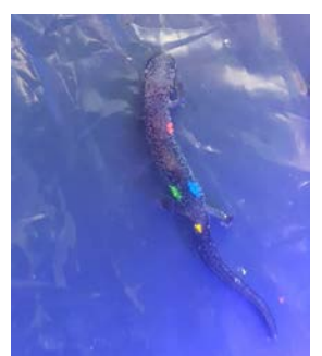
Figure 3. Visual elastomer implant markings just under the skin of a captured salamander.

During the primary seasons ( spring and fall ), each plot must be surveyed a minimum of three times, up to eight times. At least a week must pass between survey occasions, otherwise survey effectiveness drops because salamanders don't like having their cover objects moved (Marsh & Goicochea, 2003). To sample a plot, the researchers carefully turn over each wooden cover board one at a time and record the presence or absence of Red-Backed Salamanders under the cover board. If a salamander is found, it is collected, placed in a small plastic bag with the corresponding number of the wooden cover board recorded on the bag. The salamander is then set aside so that data on snout-vent length (body length) and sex can be collected. The researchers use a visual elastomer implant to uniquely mark salamanders (Fig. 3), allows for identification of a marked individual upon recapture at a different sampling time.