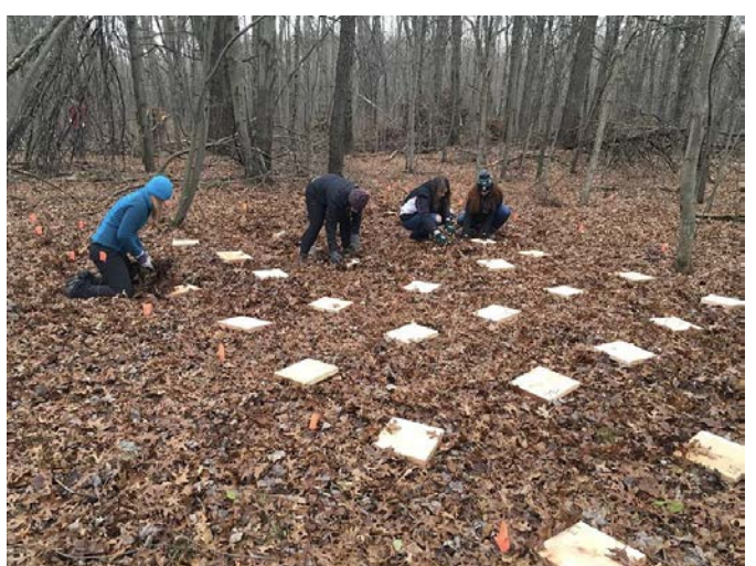
Figure 2. Example setup of a typical cover board plot for sampling.

Researchers in New York , Pennsylvania , and Virginia set up replicated study sites (referred to as NY, PA, and VA). Each site has at least six replicated plots spaced a minimum of 20 m apart. Each plot is 5 m x 10 m with wooden cover boards spaced 1 m apart, so each plot contains 50 boards (Fig. 2).